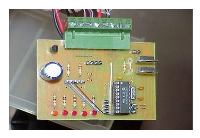
Fig -1: Name of the figure

Paragraph comes content here. Paragraph comes content here. Paragraph comes content here. Paragraph comes content here. Paragraph comes content here. Paragraph comes content here. Paragraph comes content here. Paragraph comes content here.